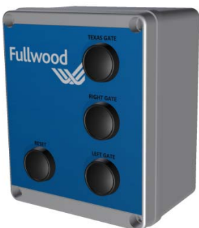
Manual Override box