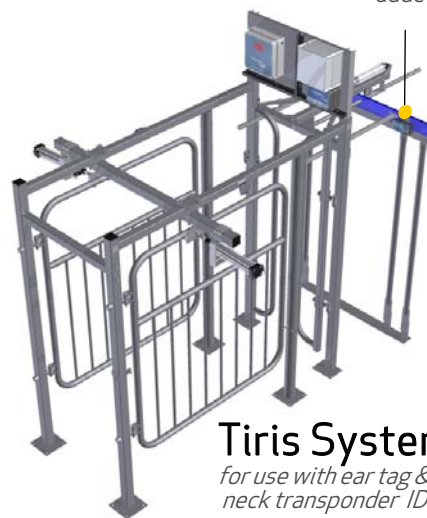
Tiris System for use with ear tag & neck transponder ID