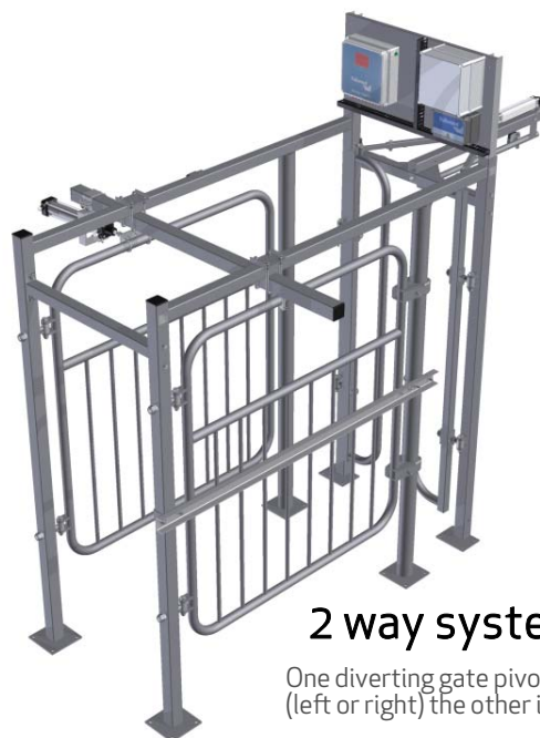
2 way system

One diverting gate pivots (left or right) the other is fixed